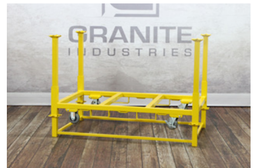
Shown with 33" chair storage rack (67136)